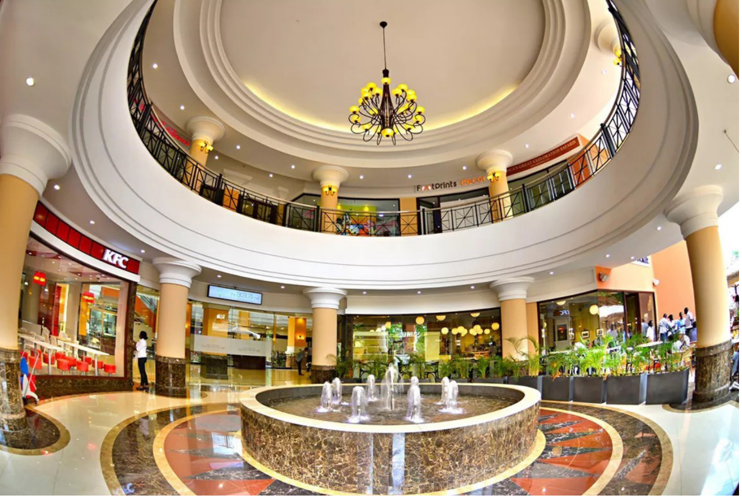
The main entrance lobby